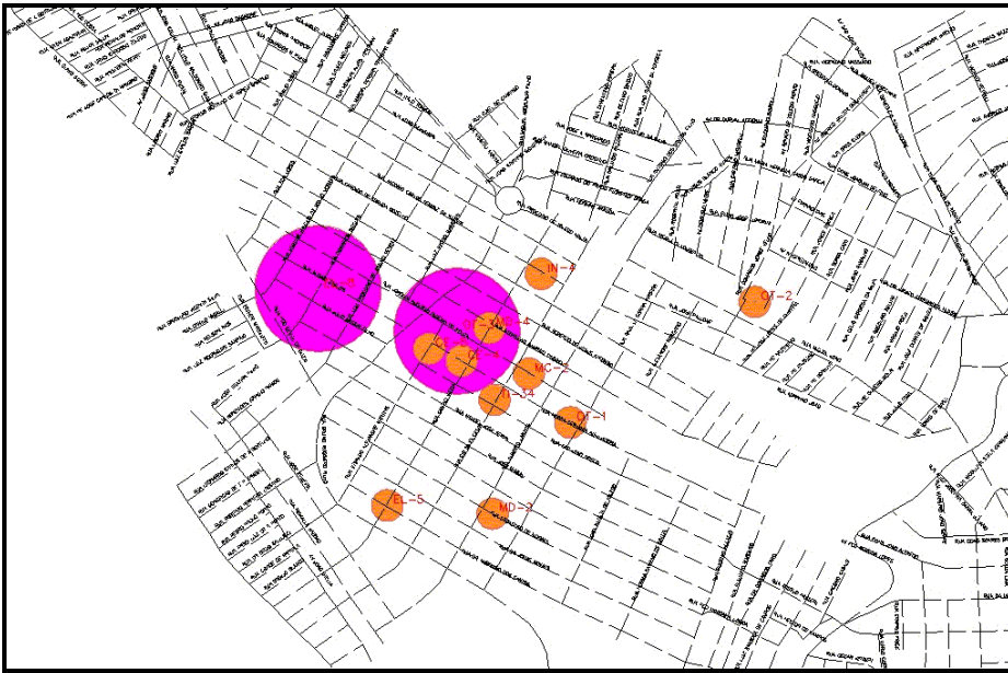
Figure 1. Companies concentrated in the Santa Felicia High Technology District

An interesting outcome is that the spatial distribution within the urban area is not uniform. This is due to two main factors: (1) factories constructed more recently having a large size tend to be concentrated in specific areas, e.g. the north and north-west; (2) small factories are concentrated in the central urban area, illustrated in Figures 1 to 3.