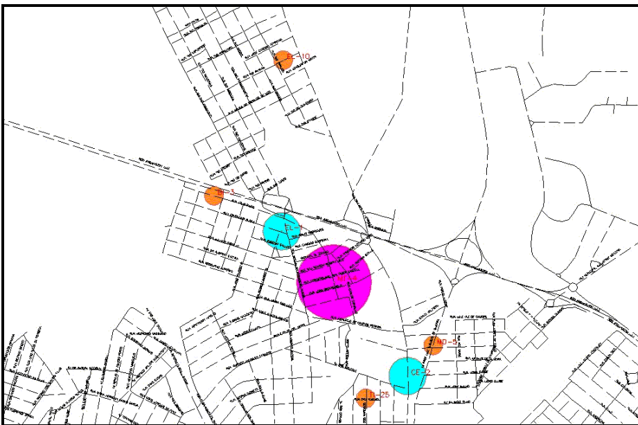
Figure 2. Companies concentrated in the Industrial District #3