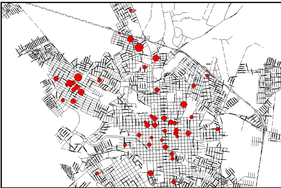
Figure 4. Proportional symbols to illustrate the natural environment neighbourhood impact.

Some companies present a more significant impact (e.g. sites 4, 8, 26 and 44 [Figure 3]) due to their major size. These variations are illustrated in Figure 4 using proportional symbols.