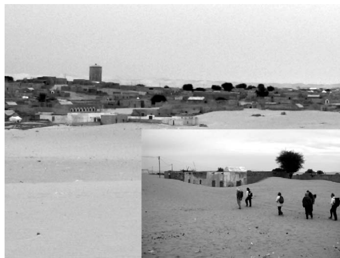
Fig. 2. Desert sands invading the ancient Mauritanian city of Chinguetti. Inset shows detail of abandoned homes on the edge of the settlement.

The implications for history and, thus, for our understanding of cultures and traditions, can be significant. Issar and Zohar (2004) discuss the significance in the Negev Desert of the ruins of 6 cities of Nabatean to Byzantine age (300 BC–500 AD). The traditional view was that these cities flourished because of extensive irrigation and water abstraction, and that their downfall was due to invasion of the desert by Arab nomads who did not care about agriculture and did not maintain dams and terraces. However, careful paleoenvironmental research has shown that it was a period of natural climatic change that led to northward migration of the desert over this region, and that many sand dunes were deposited after the end of the Byzantine Empire when the Arabs ruled over the Levant. If